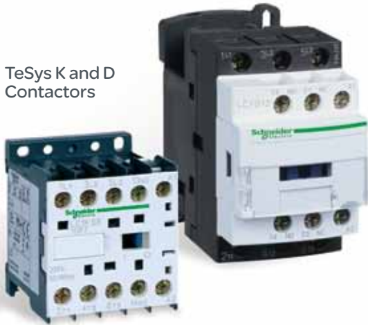
TeSys K and D Contactors

The latest development in the TeSys™ family of IEC contactors and overload relays is component high-fault short-circuit current ratings (SCCRs). This allows you to simply and easily identify the level of fault current that your component or assembly can safely withstand. Without knowing the available fault current it is impossible to determine if equipment can be safely installed.