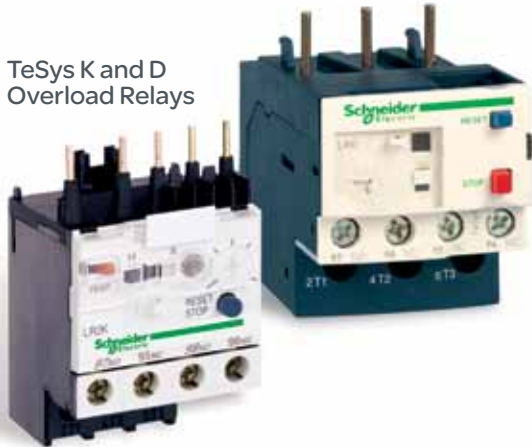
TeSys K and D Overload Relays

Last, the TeSys F is an ultra high-performance contactor used in AC3 and AC1 applications. TeSys F can control all types of motors in normal or severe service conditions. They also can control resistive, inductive, and capacitive circuits.